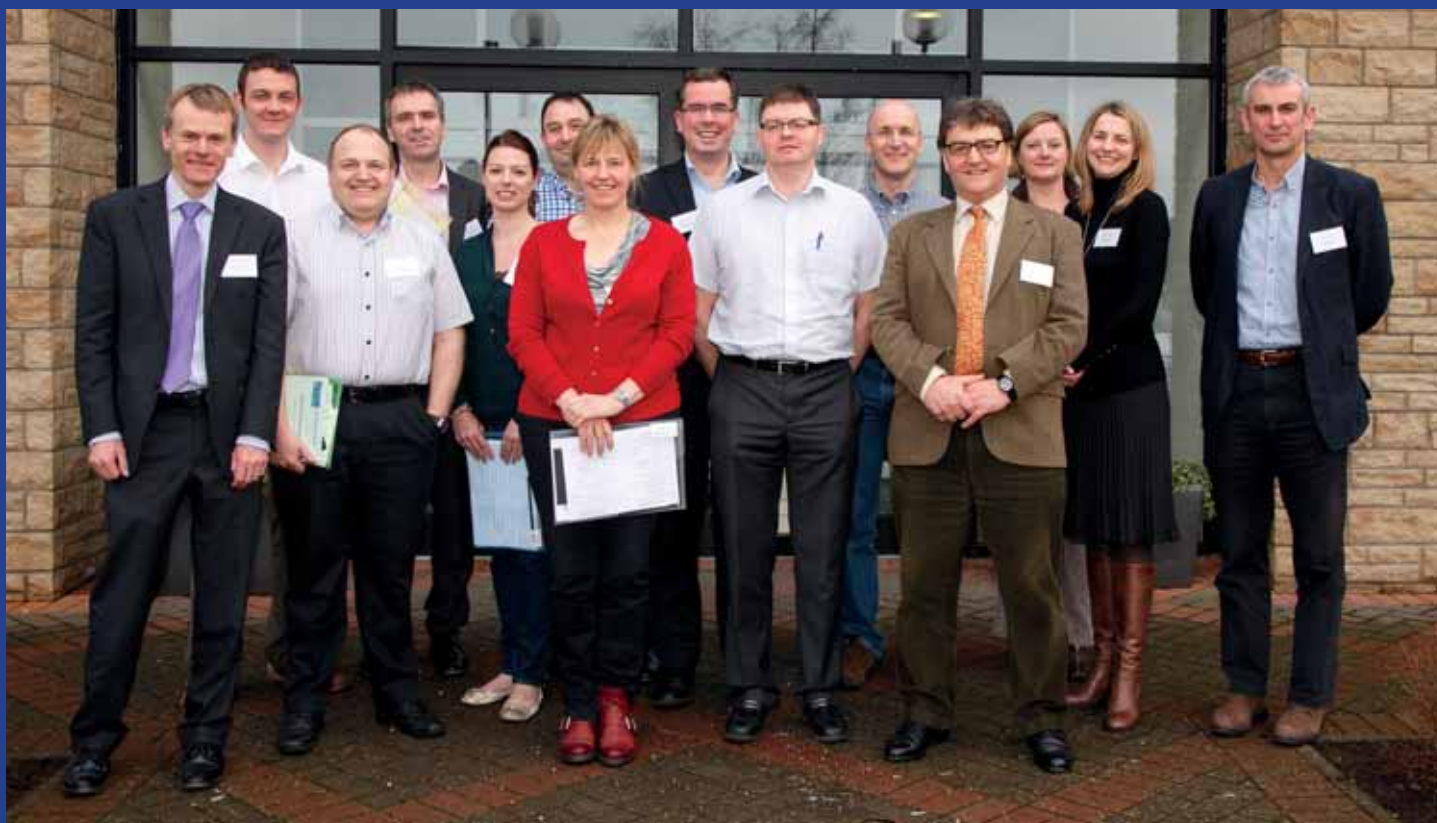
SICS Council, January 2013