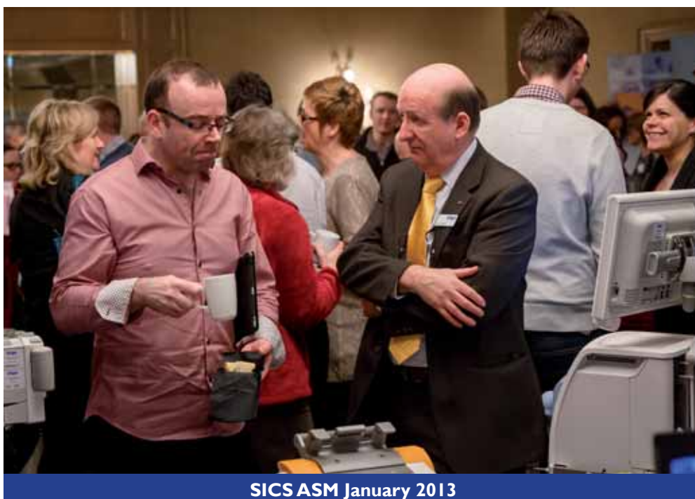
SICS ASM January 2013

In November 2012, the Academy of Medical Royal Colleges Donation Ethics Committee started to look at the ethical rationale for interventions such as the use of heparin and management of the potential organ donor at the end of life. The specific ethical