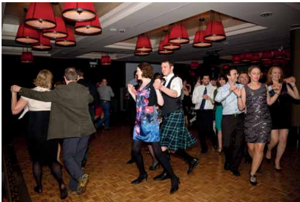
Ceilidh, SICS ASM January 2013