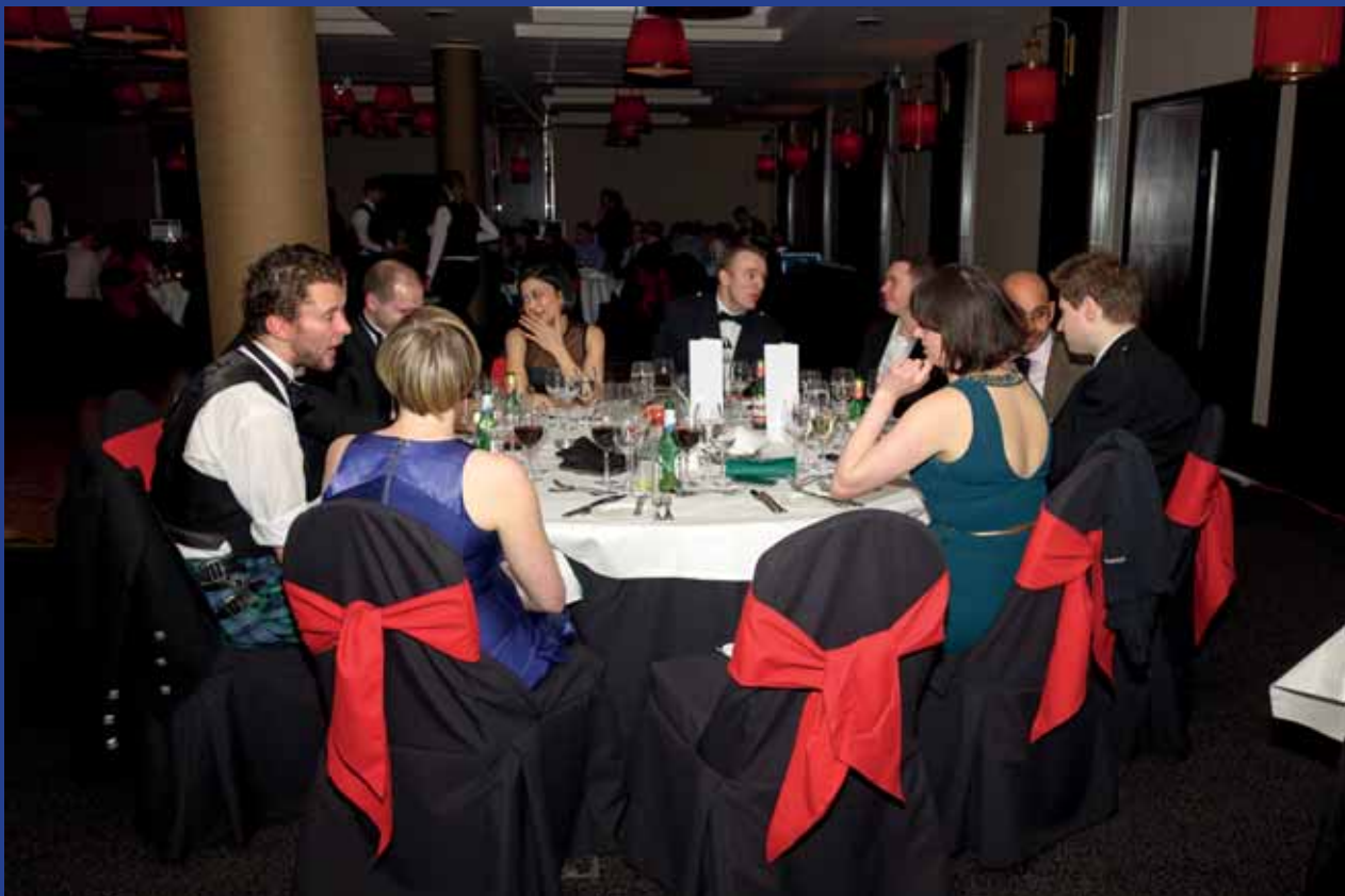
SICS ASM Dinner, January 2013